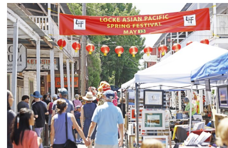
Main Street lined with visitors and vendors