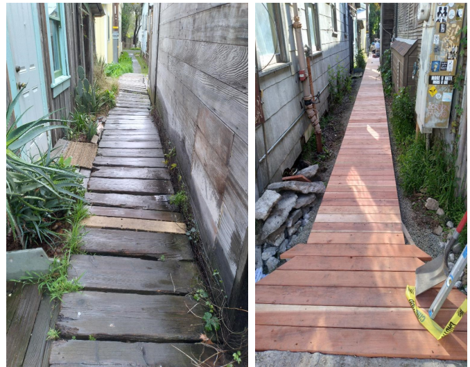
Before and after photos of walkway from Main Street to Key Street.