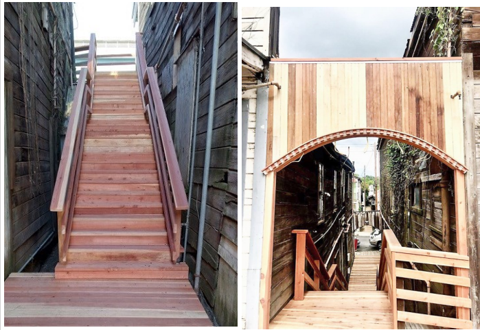
L: New stairwell and landing. R: New archway facing River Road.