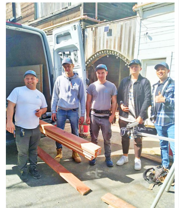
Skilled artisans from ABD

It was decided to replace the rotted wooden landing at the bottom of the north stairway that leads from River Road to Main Street. Upon reaching the stairway, it was determined that the stairway was in worse condition than the walkways and landing. So, the entire stairway had to be replaced. Then it became painfully obvious that the walkway (bridge) that connects River Road to the stairway was in horrid condition. Even dangerous. But funding was running low. In fact, there were not enough funds remaining in the LMC bank account to cover the final "bridge" construction.