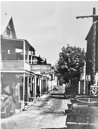
Happy Café on 13964 Main Street approx. late 1930's.