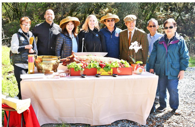
Traditional celebration of Ching Ming includes whole roast pig with accompanying side dishes.